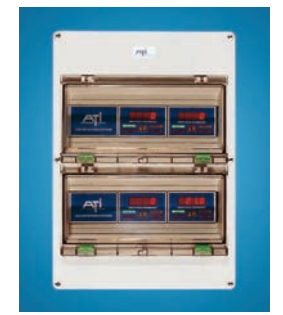
Multi-Channel B14 Receiver