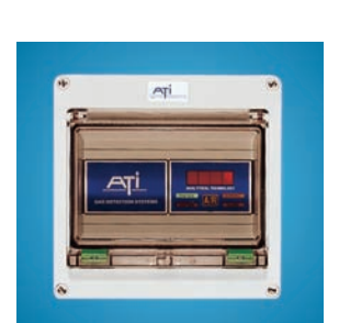
Single Channel B14 Receiver

If alarming and display is required, the B14 receiver can be used with either a single channel or multi-channel receiver system.